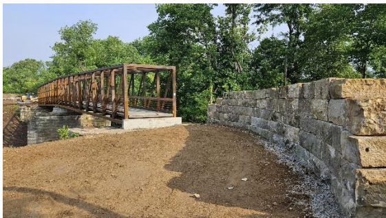
Grant Wood Trail Big Creek Bridge. Retaining wall constructed of original limestone blocks at east end of new trail bridge. How cool is that!