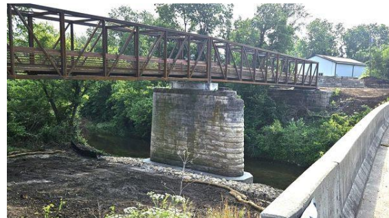
Trail bridge pier and abutment during construction, almost ready to roll! The bridge is truly an art form. Well done county planners and engineers.