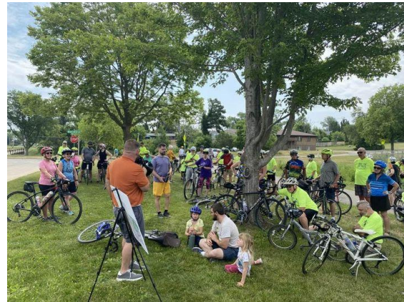
Riders relax as they learn about trail projects.