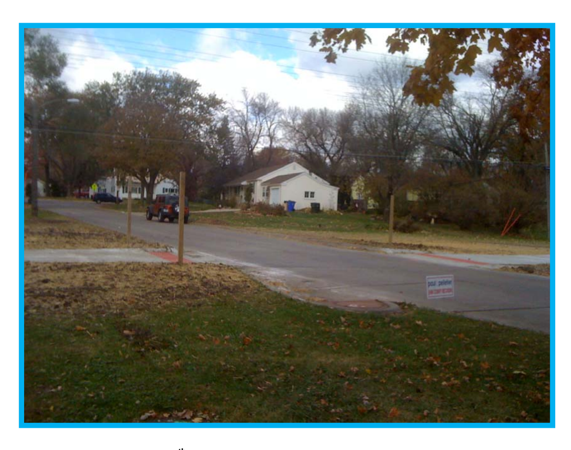
\mathbf{27}^{\text{th}} Street NE and the CEMAR Trail crossing.