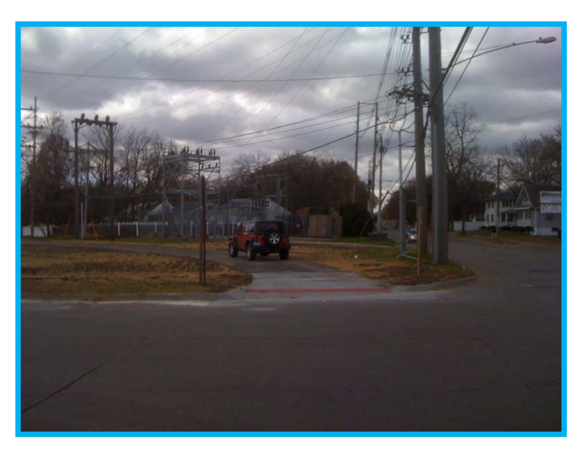
29<sup>th</sup> Street NE at B Avenue. The CEMAR Trail is a 12 foot wide asphalt multi-use trail for walking, bicycling, rollerblading, etc. Motorized vehicles are prohibited.