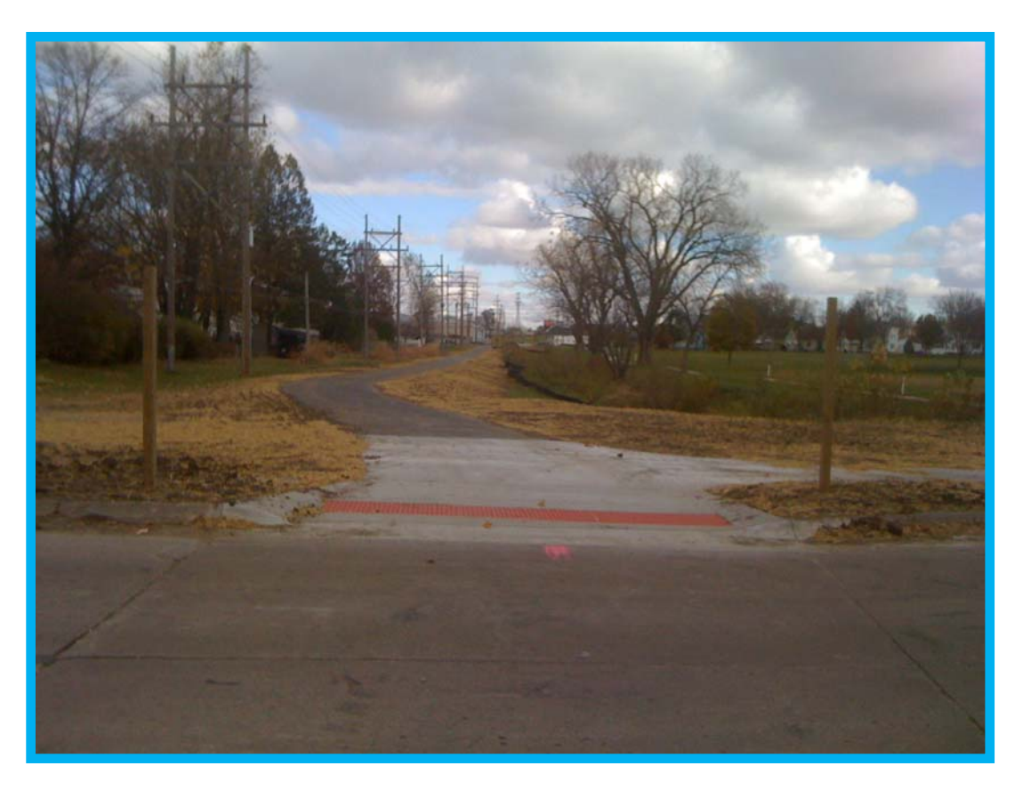
Looking Northeast at 27<sup>th</sup> Street NE and the CEMAR Trail crossing.