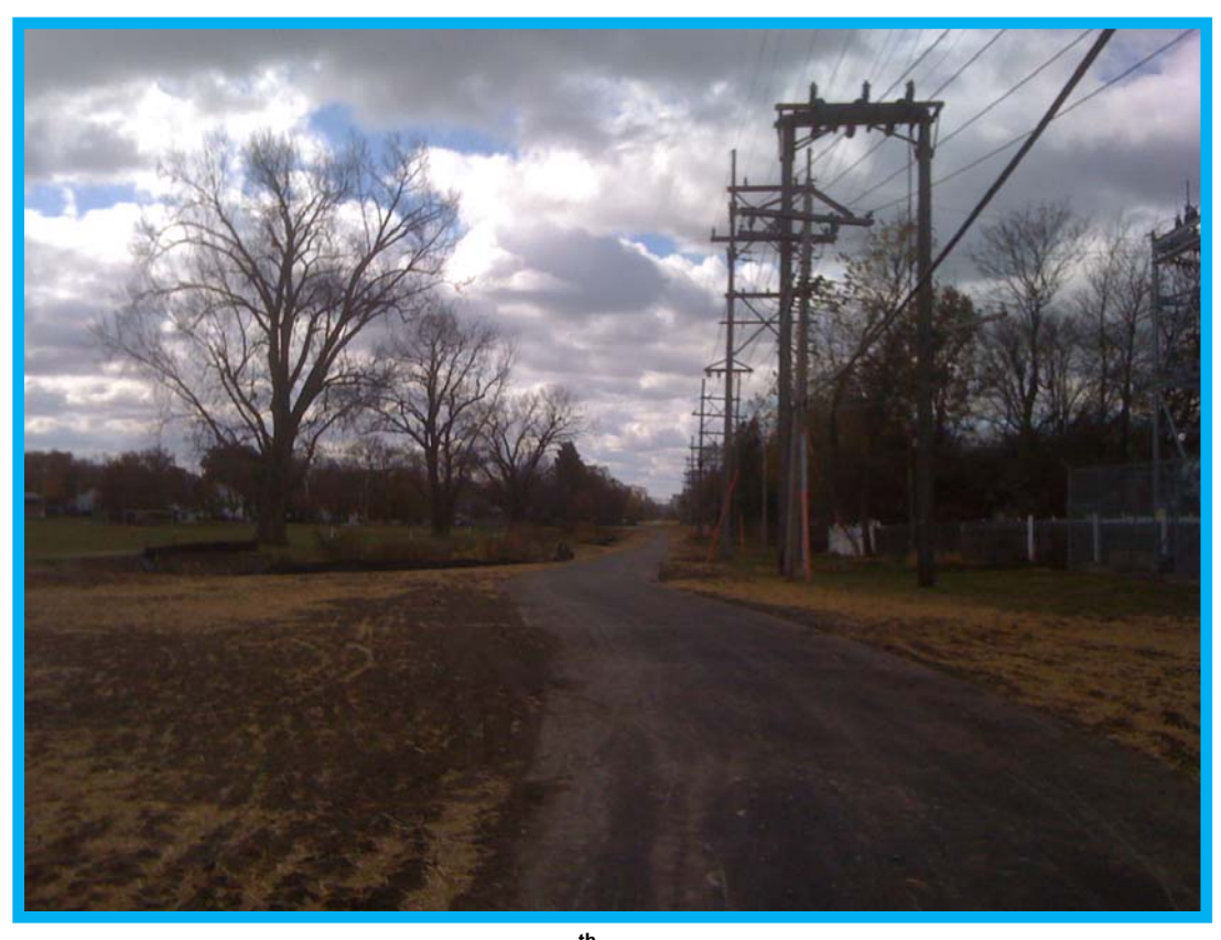
Looking Southwest at 29<sup>th</sup> Street NE and B Avenue.