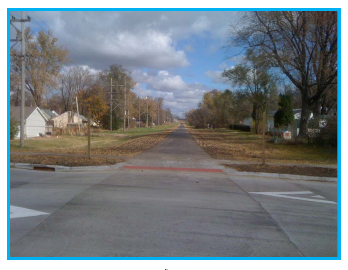
Looking Northeast at Prairie Drive/20<sup>th</sup> Street NE and the CEMAR Trail crossing.