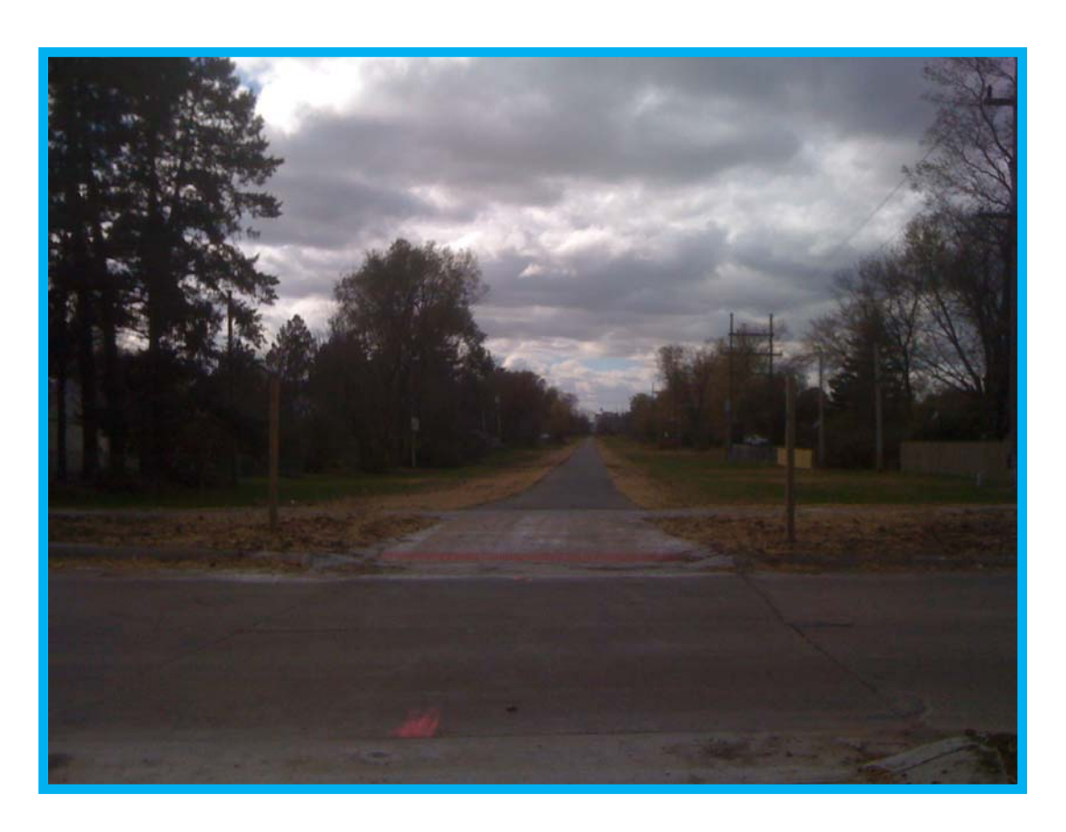
Looking Southwest at 27<sup>th</sup> Street NE and the CEMAR Trail crossing.