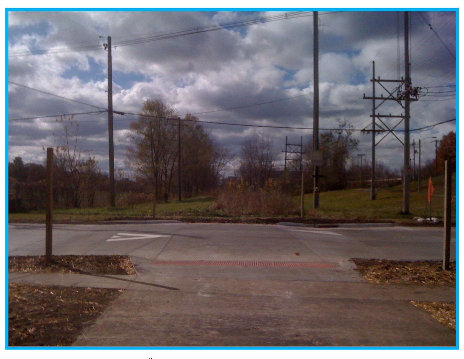
Looking Southwest at Prairie Drive/20<sup>th</sup> Street NE and the CEMAR Trail crossing. The CEMAR Trail Phase 1 project will begin at the Cedar Lake parking lot on Shaver Rd NE and end here.