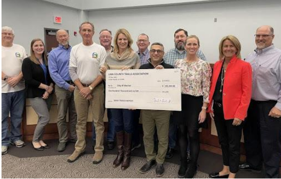
City of Marion is presented a check of $100,000 for the Lucore Pedestrian Bridge Project