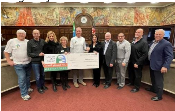
City of Cedar Rapids is presented a check of $100,000 for the 4th Street Trail engineering.