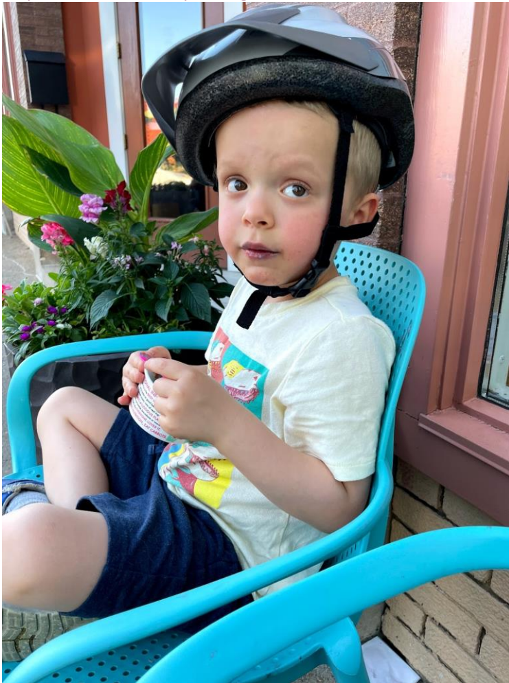
15-Minutes to ice cream - now that's a necessity!