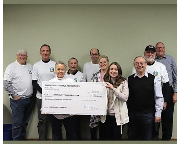
Linn County Conservation is presented a check of $100,000 for paving the Grant Wood Trail.

We want to thank all the individual and business donors who helped make this happen including $50,000 from the Hall-Perrine Foundation, $10,000 from Greater Cedar Rapids Community Foundation Linn County Fund, $5,000 match donation from the Hawkeye Bicycle Association and $5,000 from UFG Insurance.